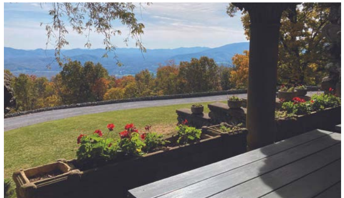
A stunning view for our inaugural fundraiser