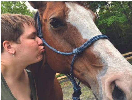
A resident with her equine partner. Teva. at equine-focused recovery.

Experiencing joy during recovery is one of the most important factors for long-term success. In early sobriety, a future without drugs or alcohol can look like endless deprivation. In 2021, we introduced the Joy Project, a holistic program of activities and learning that supports our residents' recovery journeys. The Joy Project offers positive, healthy activities that help the women rebuild an organic sense of joy, purpose, and well-being. The goal is to fill the void created when residents remove drugs and alcohol from their lives.