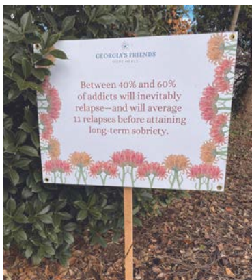
One of the educational signs lining the one-mile walk