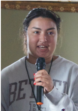
Georgia's House alumnae share their recovery stories at our second-annual Walk a Mile in Their Shoes fundraiser.