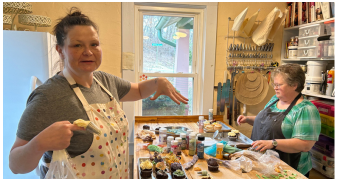
Residents enjoying a cupcake-decorating workshop.