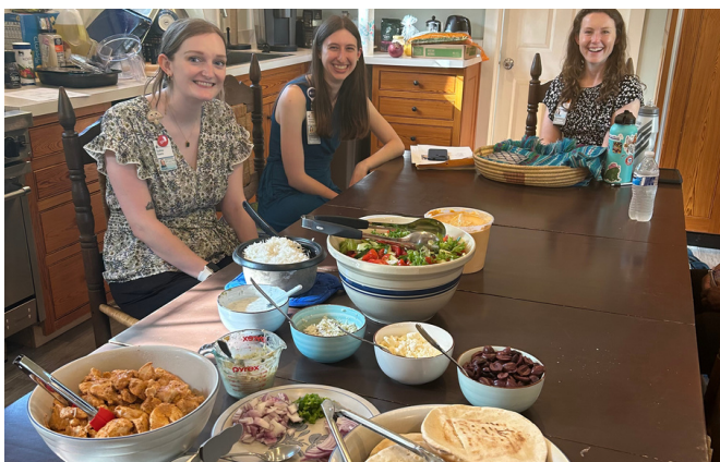
Dietitians from UVA Health led a workshop for residents on healthy-eating habits.